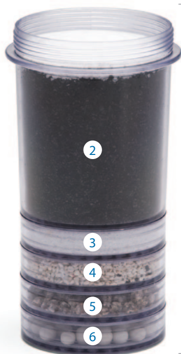
5 STAGE ULTRASONIC FILTER Lasts 4 – 6 months.