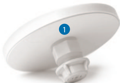
CERAMIC STONE PRE-FILTER Last 1 year with normal use.