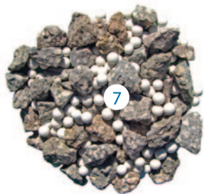
MINERAL STONE IMMERSION Lasts up to 5 years.